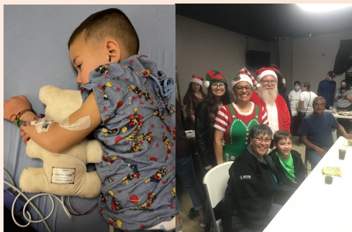
SACC Hug-A-Bears A Gift That Lasts Forever