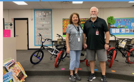
PTCC Acacia Elementary

Please feel free to check-out our Newsletter to see how Chapter 66 have used past grants in our communities.